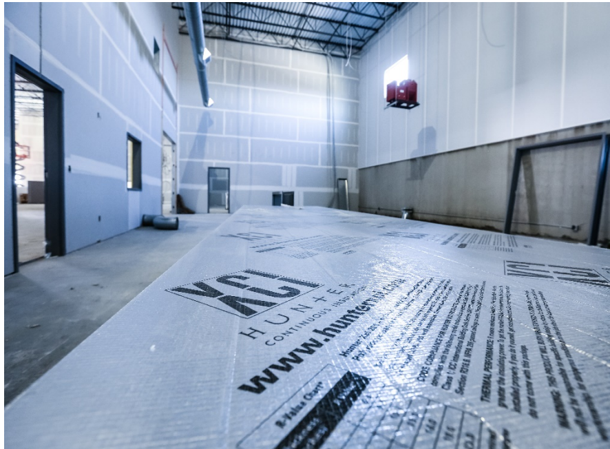
The new building is insulated with continuous, foil-faced polyiso insulation board.

The new building is insulated with continuous, foil-faced polyiso panels made by Hunter Panels, a Carlisle Construction Materials company. It also contains hot water heaters manufactured by Bradford White. Both companies are Hennecke customers.