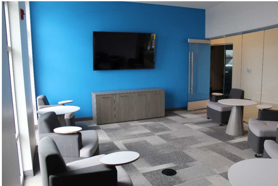
Hennecke's new North American headquarters features more office and conference spaces designed to foster collaboration and communication.

The new address is: Hennecke Group, 1000 Energy Drive, Bridgeville, PA, 15017. Telephone numbers and email address remain unchanged.